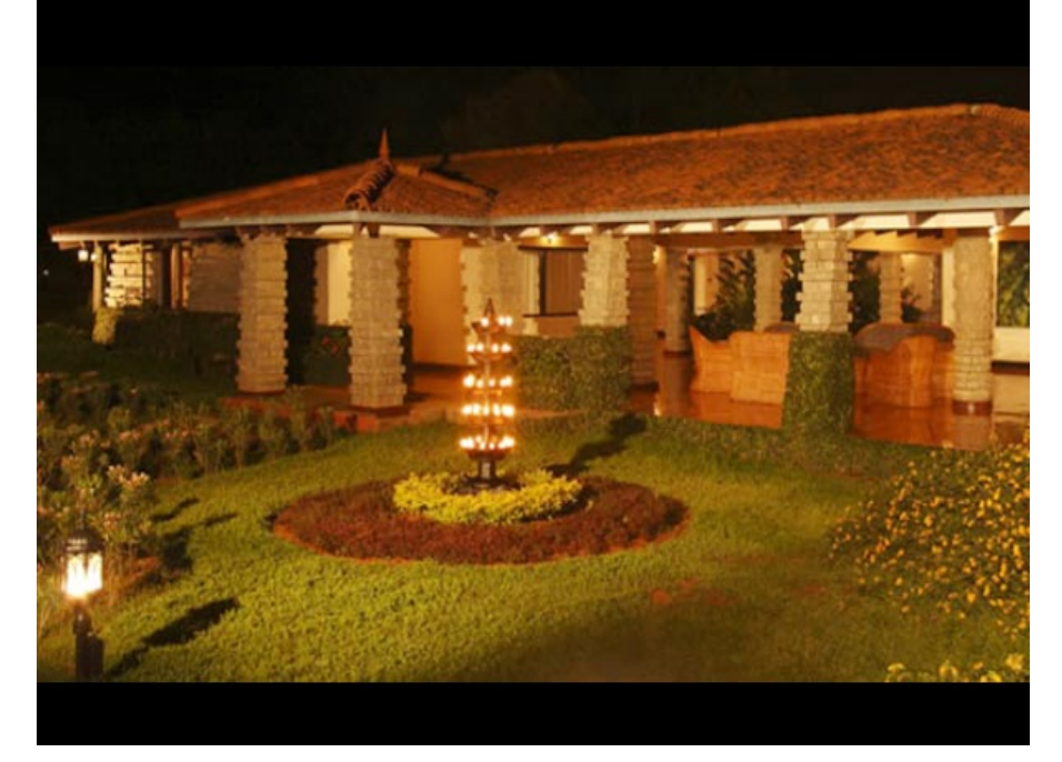
Go to: Soukya Holistic Health Centre Where: Bangalore

Located in Whitefield, a suburb of Bangalore, the Soukya Holistic Health Centre is a luxury wellness spa that focuses on alternative health treatments. Leech therapy - to cleanse the body off toxins - as well as nasal cleansing, yoga, meditation and other Ayurvedic treatments, including a satvic diet, are offered to those looking for rejuvenation.