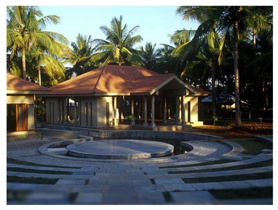
Go to: Shreyas Yoga Retreat Where: Bangalore

The wellness spa, which has won Conde Nast's Best Destination Spa award in 2010, offers guests a choice of rooms, suites and 1- or 2-bedroom villas.