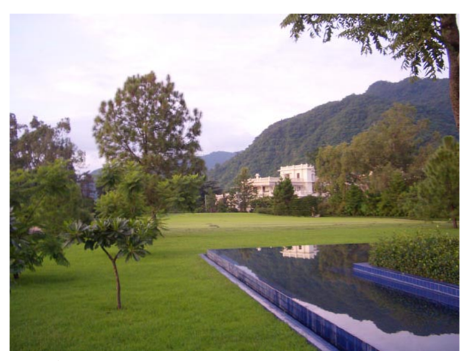
Go to: Ananda Spa Where: The Himalayas

Prince Charles' wife, Camilla, the Duchess of Cornwall spent four days at the wellness spa, and stayed at the ₹ 83,000-a-night Presidential Suite. The 2,500 sqft suite has three bedrooms, a private garden, an open-air shower and a lotus pond.