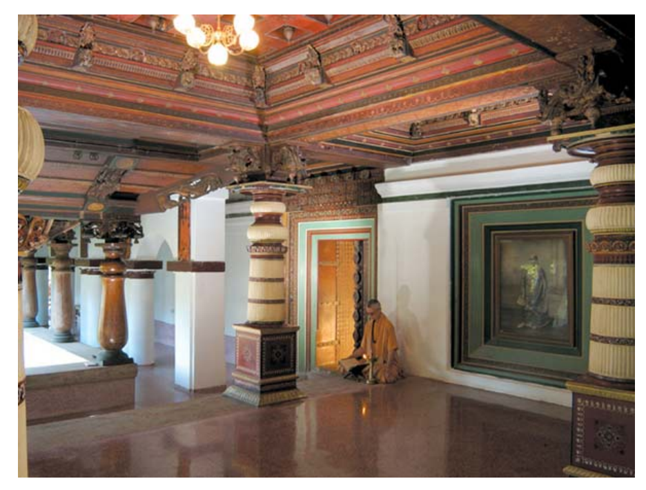
Go to: Kalari Kovilakom Where: Kollengode, Kerala

The luxurious setting also goes a long way in helping guests relax. Tastefully designed tent cottages, villas, a swimming pool, library and cinema centre aid the R&R process. Rates start at ₹ 12,000 a night, but you can add on Yoga Retreat, Silent Retreat, Wellness for the Soul and other such programmes for upwards of ₹ 1.35 lakh per programme.